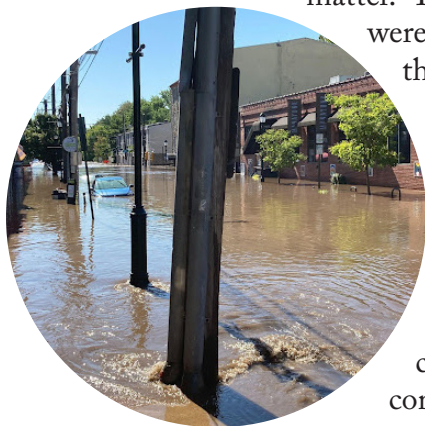
ABOVE: SHURS LANE AND MAIN STREET IN MANAYUNK THE DAY AFTER IDA