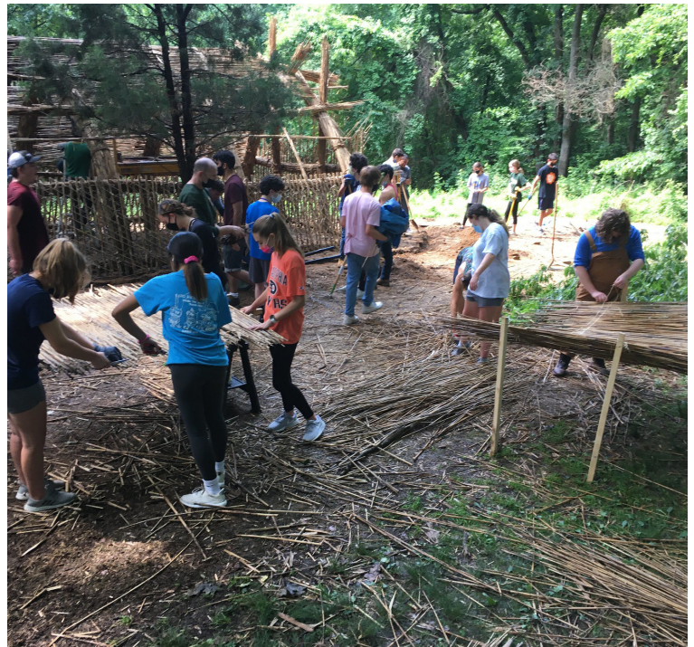
OVER THE COURSE OF TWO WEEKS, 200 VOLUNTEERS CAME TOGETHER FOR THE BUILDING PROCESS. HERE, AIM ACADEMY 9TH AND 10TH GRADERS LEARNED HOW TO WEAVE, DIG, AND WRAP REEDS TO CONSTRUCT THE ROOF AND WALLS OF THIS IRAQI STRUCTURE.