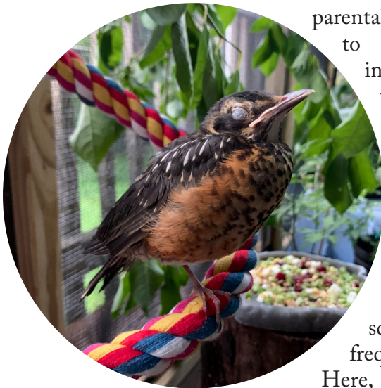
ABOVE: A FLEDGLING ROBIN TAKES A POST-FEEDING NAP IN THE AVIARY SURROUNDED BY LIVE PLANTS AND OTHER NATURAL ITEMS TO MIMIC A NATURAL ENVIRONMENT