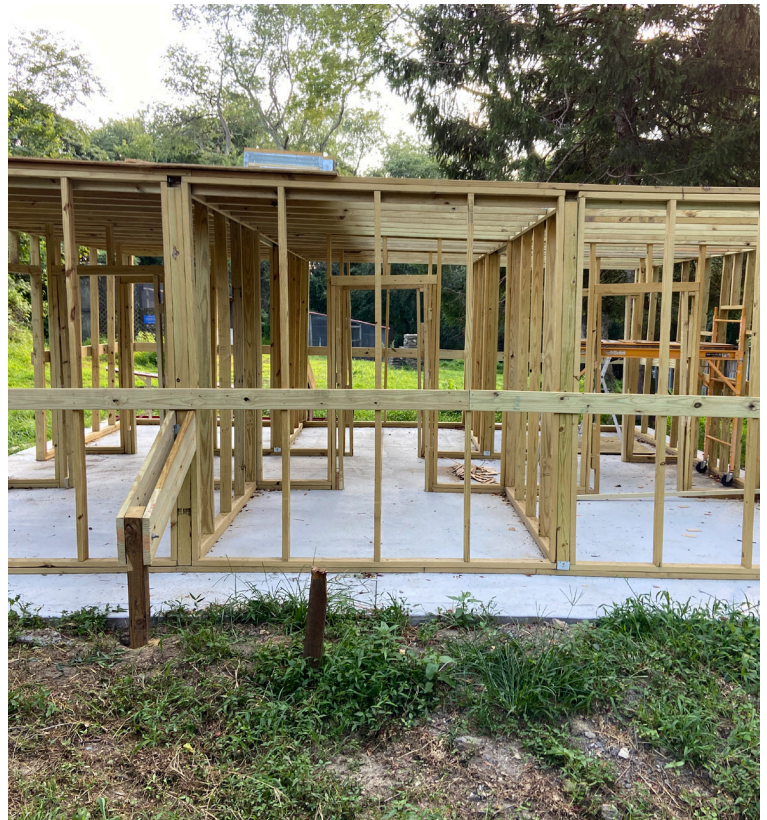
ABOVE: FRAMING FOR SQUIRREL ENCLOSURE

patients will have more room to practice their climbing, hiding, and foraging skills. This is especially important for fall baby squirrels who face their first winter when they are just six months old. The enclosure also provides more space for overwintering patients, including our recent squirrel babies, who will spend the winter with us, and be released in the spring. While this spacious, sturdy outdoor enclosure provides vital space for many litters of orphaned squirrels, it will also do double-duty for opossums and other small mammals. ✂